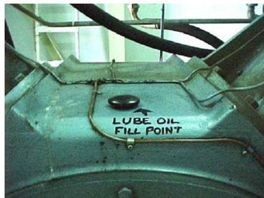
FIG # 4 CLEAR MARKINGS ELIMINATE ERRORS