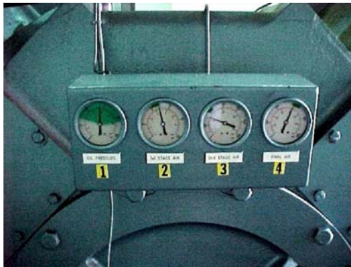
FIG # 1 GAUGES WITH OPERATING RANGES