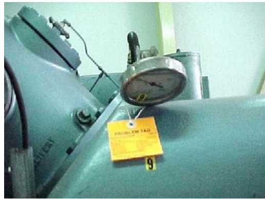
FIG # 2 PROBLEM TAG