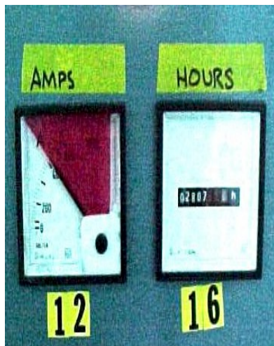
FIG # 3 WHAT ARE WE READING? IN WHAT ORDER?